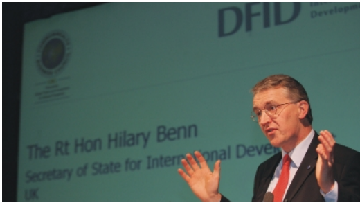
The Rt. Hon Hilary Benn, Secretary of State for International Development, UK, addressing delegates at the Conference.