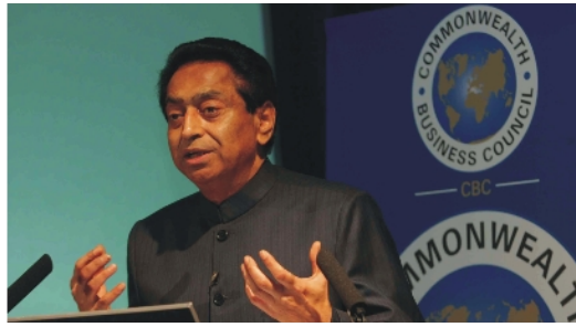
The Hon. Mr. Kamal Nath, Minister of Commerce and Industry of India, addressing delegates at the Conference